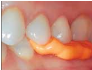
Clone Bite makes an accurate impression for an exact bite registration.

Clone Bite bite registration material is perfect for preliminary impressions for crown/bridge procedures and temporaries.