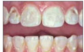
Severe decalcification and caries due to poor hygiene during orthodontic treatment. Evidence shows that a significant amount of decalcification can be prevented by applying fluoride varnish every six weeks 3 .