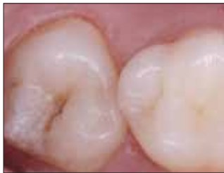
Deep, precarious grooves/early lesions