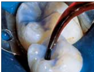
1. Ultra-Etch 15 seconds; rinse.