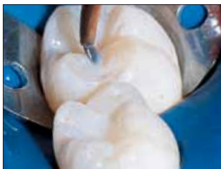
3. Apply UltraSeal XT plus.