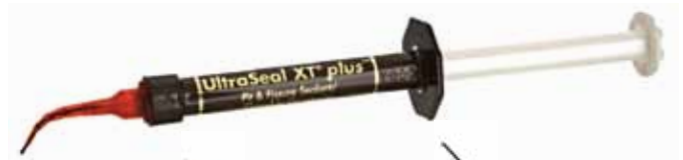
Inspirial Brush tip #1033-I - 500pk - pg 131