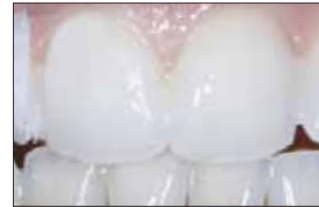
Avoid brushing teeth or chewing hard foods for 4-6 hours after treatment.

Blot teeth dry prior to application. Express a small bead from the tip. Brush a smooth layer onto area being treated. Gently pull the lip over the tooth surface to ensure saliva contact with the varnish. The varnish hardens when it comes in contact with the saliva and will stay in place for several days to weeks.