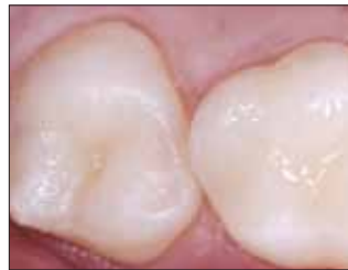
A quality seal. A tremendous service to patients of all ages.