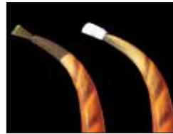
Thixotropic UltraSeal XT plus thins when it flows through the helical channel of the Inspirial Brush tip to brush end; firms after placement.