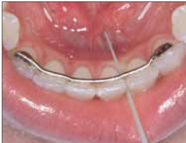
Use Opalpix to clean under and around bonded retainers.