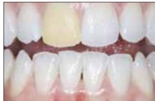
Typical varnishes are yellow, as shown on the right central, versus the esthetic white Flor-Opal Varnish White as seen on the remaining upper incisors.