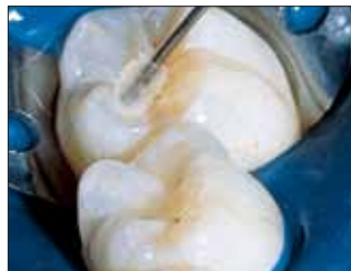
2. Air dry and apply PrimaDry.