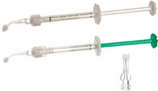
FX Flex tip #6026 - 75pk - pg 130